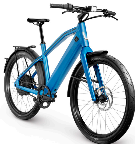
Stromer Amsterdam Double Bag 30 l